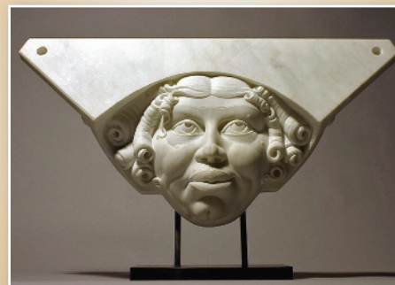
Italian Marble Sculpture, by Bela Bacsí